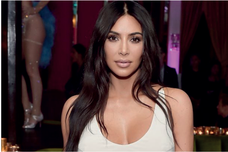
Kim has flawless skin

A-listers like Kim Kardashian and J-Lo are raving about the needle-free CACI Synergy facial toning treatment